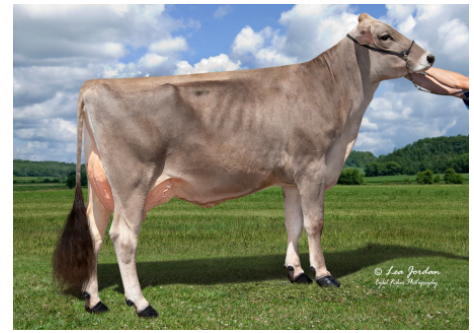
Dam: Hilltop Acres DB Whisper ETV 'E 91 E 91 MS'

Sire: Jennings Gap Time Out Dam: Hilltop Acres DB Whisper-ETV 'E 91 E 91 MS' 2-1 110d 3x 10,380 5.1 526 3.2 330 MGS: Switzer Tals Drdvl Doboy-ET MGD: Top Acres Durham Wintu-ET 'V 87 V 87 MS' 2-8 175d 3x 13,701 3.7 481 3.0 355