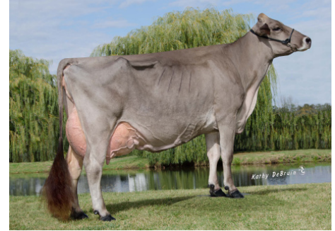
3rd Dam: Top Acres Supreme Wizard ET '2E 95' GRAND CHAMPION WORLD DAIRY EXPO 2017 ALL AMERICAN 2013 & 2017 RESERVE ALL AMERICAN 2012, 2015 & 2016 MEMBER OF ALL AMERICAN PRODUCE OF DAM 2013, '14, '15 AND '16