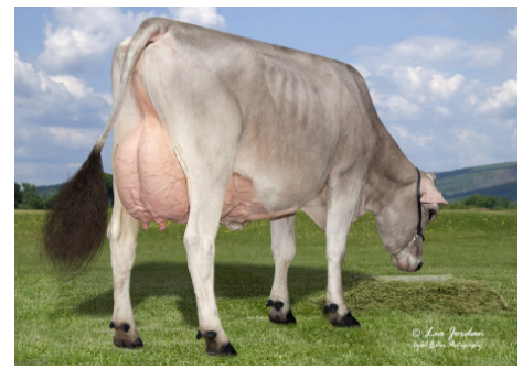
Dam: Hilltop Acres Princess ETV 'E 91 E 91 MS' 2nd Lactation