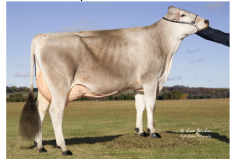
Dam: Hilltop Acres Princess ETV 'E 91 E 91 MS' 1st Lactation