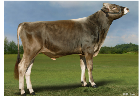
Hilltop Acres Perfection ETV