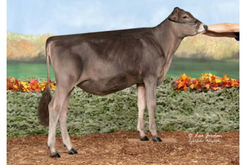
Hilltop Acres D Tiana ETV 3rd Place Spring Calf World Dairy Expo 2023 1st Place Spring Calf Iowa State Fair 2023 Owned by Hilltop Acres, IA