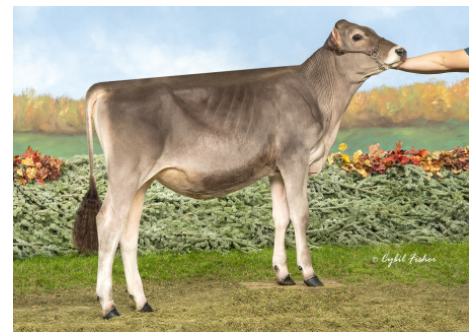
Brown Heaven Design Freida 1st place Spring Calf World Dairy Expo 2023 Owned by Brown Heaven Farm, Quebec, Canada