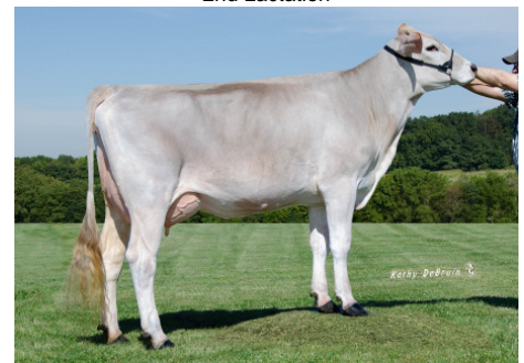
La Rainbow Sweet Solara ET NP Full Sister to 54BS604 SPARK *NP Owned by Trevor Bigelow, NY