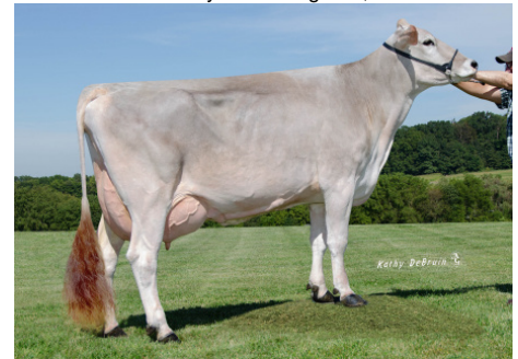
La Rainbow Sweet Siesta Dam of 54BS604 SPARK *NP 2nd Lactation