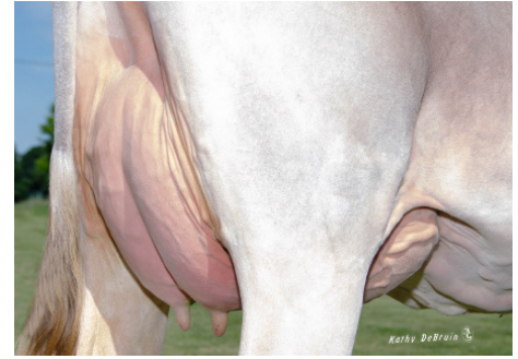
La Rainbow Sweet Solara ET NP Full Sister to 54BS604 SPARK *NP Owned by Trevor Bigelow, NY