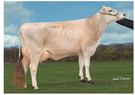
Hilltop Acres CAD PAULA 'V 87 V 88 MS' 1-11 365d 3x 32,990 4.6 1,522 3.8 1,257

Sire: Cozy Nook Daredevil Toby ET Dam: Hilltop Acres Cad Paula 'V87 V88 MS' 1-11 365d 3x 32,990 4.6 1,522 3.8 1,257 MGS: Jo-Bo Vigor Bush ET *TM MGD: Hilltop Acres Bush Denver '+ 83 V 85 MS' 4-03 365d 3x 33,370 4.3 1,432 3.7 1,241