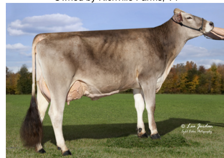
Hilltop Acres T Karina ETV Owned by Hilltop Acres, IA