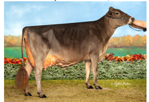
Pit-Crew Rich Prankster ET ALL AMERICAN 4 YEAR OLD 2021 Owned by Pit-Crew Genetics, MN