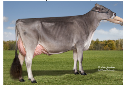
Giesy Manor Richard Fauna - 3rd Lactation 1st Place 4-Year-Old Southwest Fall National 2020 Honorable Mention All-American Jr. 3-Year-Old 2019 Owned by Edge-View Genetics, New York & Kentucky